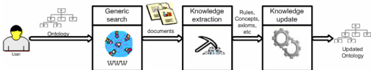
Figure 2. Usage scenario of the Knowledge management platform.

The retrieved results are saved in the KMPs database and are also displayed organised under the ontologies nodes and the user views the results that correspond to a specific ontology node by clicking on this node. These results are further analysed in a semantic way, using the ontology terms that characterize them.