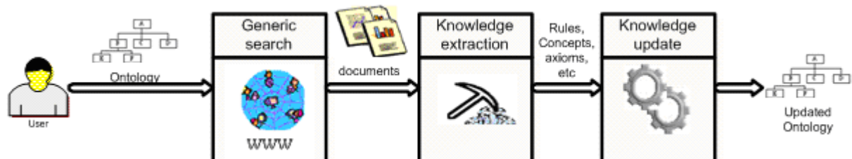
Figure 2. Usage scenario of the Knowledge management platform.

The retrieved results are saved in the KMPs database and are also displayed organised under the ontologies nodes and the user views the results that correspond to a specific ontology node by clicking on this node. These results are further analysed in a semantic way, using the ontology terms that characterize them.